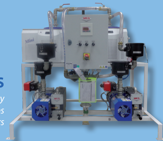
CRYOLIS Plant with lubricated rotary vane vacuum pumps and cryogenic condensers