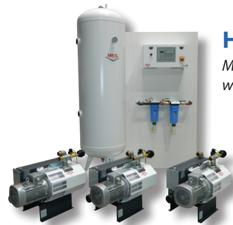
HOSPIVAC® G Modular plant from 1 to 6 pumps with lubricated rotary vane vacuum pumps