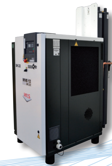
HOSPITAIR® PACK S Compressed air plant for PSA oxygen generator