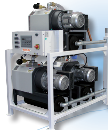
ANAESTIVAC 2 - AGSS Duplex plant for anaesthetic waste gases scavenging, oil-free pumps