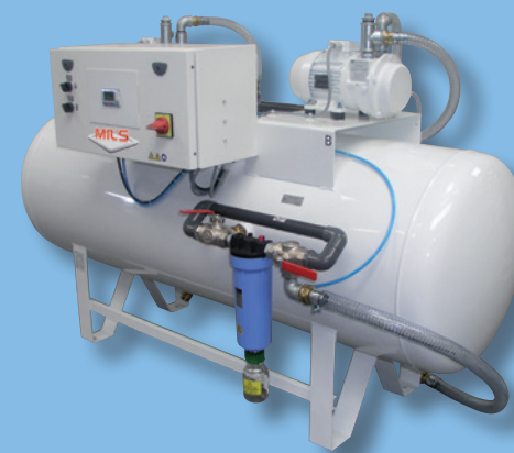
LABOVAC 2 Duplex plant with liquid ring vacuum pumps