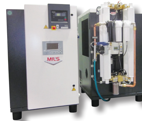
HOSPITAIR® PACK Compact design plant with lubricated screw compressors