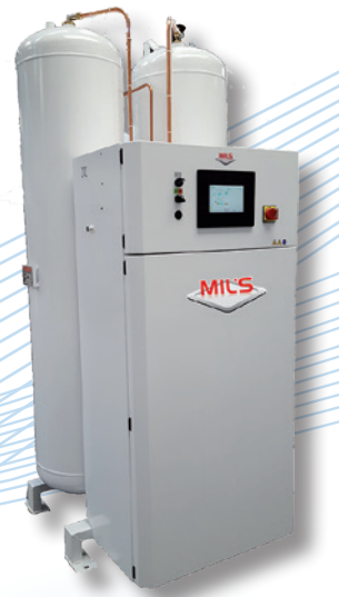
PRO 2 XY® PSA oxygen generator