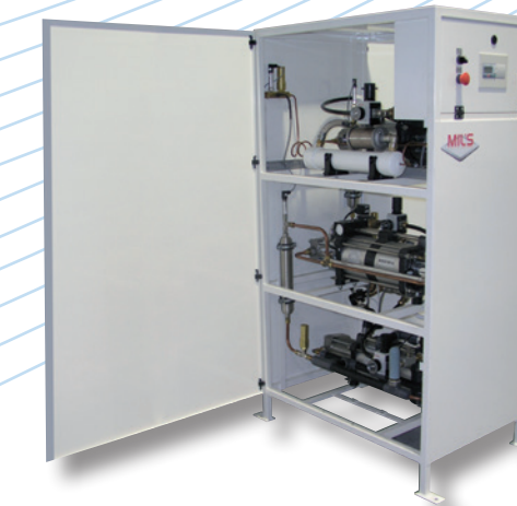
OX HP High pressure oil-free pneumatic booster