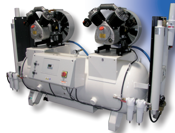
AIRMIL'S 2 Duplex plant with lubricated piston compressors for technical air